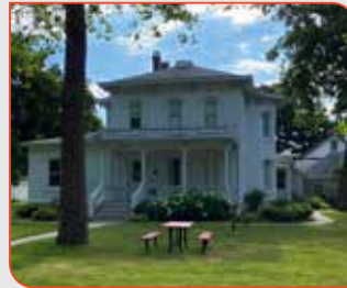
Residential Addiction Treatment Central Iowa Campus Youth Recovery House