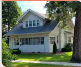
Residential Addiction Treatment Central Iowa Campus Seven12

Picking a treatment program is a big decision, let us help you.